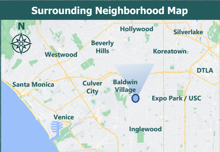
Surrounding Neighborhood Map